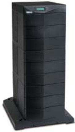
9170+ 9-slot configuration