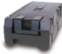
Battery module (two per slot)