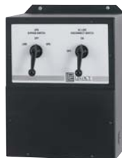
Maintenance Bypass Switch