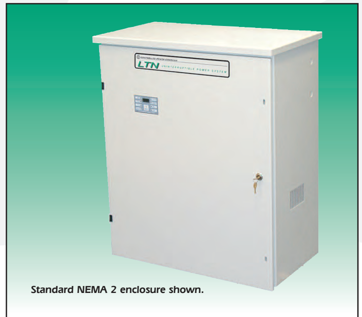
Standard NEMA 2 enclosure shown.